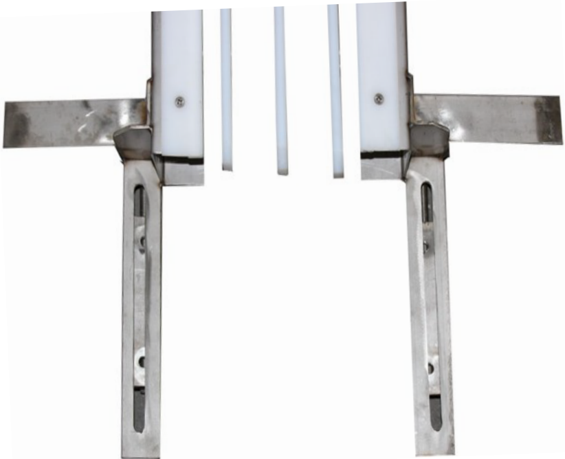
Fig 1: Take-ups overhead view